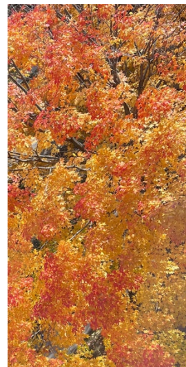
Vibrant fall foliage as viewed from the Bethel University Trustee's Boardroom

Thank you for joining us in celebrating! BethelUniversity.edu/FaithfulGiving