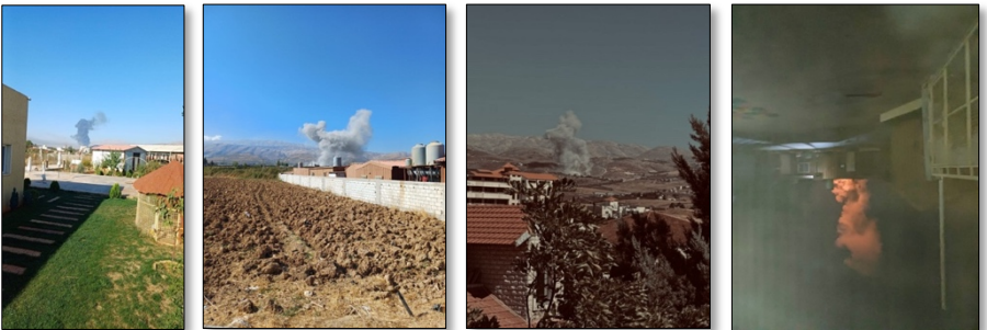
Many explosions are near our Family Oasis – no direct hits but the blasts cause damage to our buildings. Our brave staff serve don't serve at our unsafe campus but wherever needs are greatest.